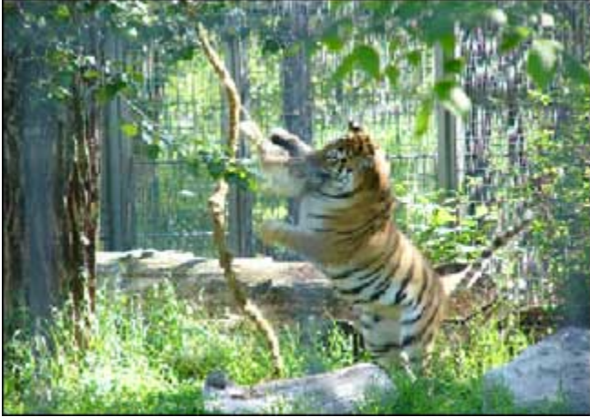
Tiger attacks “hanging prey” as part of the Calgary Zoo’s Enrichment Day activities.